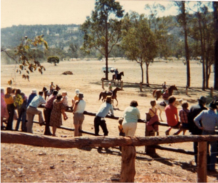
Back in the Day Quindanning Picnic Race Club